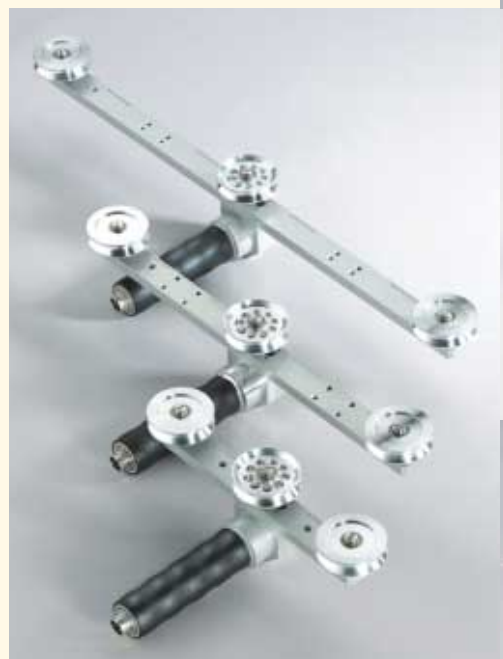
Tritens® Standard versions